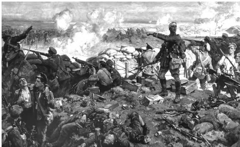
Second Battle of Ypres, 22 April to 25 May 1915 by Richard Jack.

that they had picked up as they came through the 15th Battalion's lines. "We stood up on our parapet and gave three ruddy cheers and shook our fists at them. We gave them everything we had, and they figured it wasn't worth while, and they just turned around and went back. They did that again, and we did it again. We were quite happy about it. So then they did it a third time. When they went back the third time, we thought we'd won the war!"