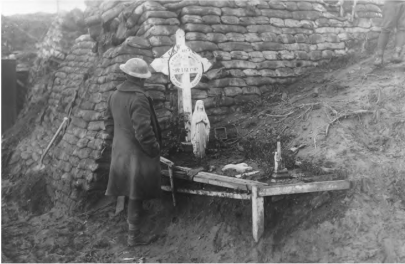
A Canadian at the graveside of a Canadian who was killed in 2nd Battle of Ypres - November 1917.

achievements had brought the Canadians immense gain in stature, for had they not proved themselves more than a match for the enemy and not less than the equal of their Allied comrades in arras. In their first major operation of the War Canadian soldiers had acquired an indomitable confidence which was to carry them irresistibly forward in the battles which lay ahead.