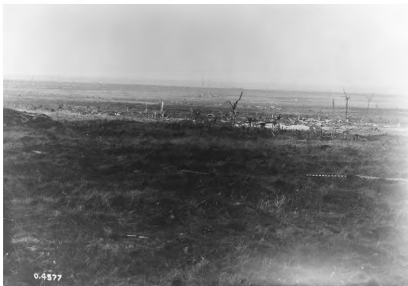
General view of ground over which Germans advanced after releasing gas, 22 & 23 April, 1915. Photographed in May, 1919.

training. But was I ever proud of them? If they had been trained for ten years they couldn't have acted better. To think of these kids that had been pulled from all over the country, and the way they behaved in a murderous fare like that. I never felt so proud of a bunch of boys in my life."